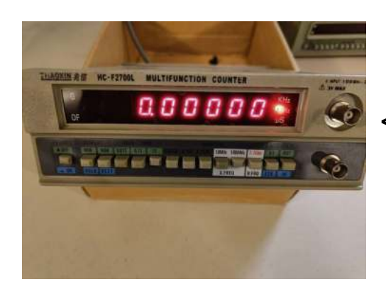
<>< Haoxin HC-F2700 >>>> Multifunction Counter