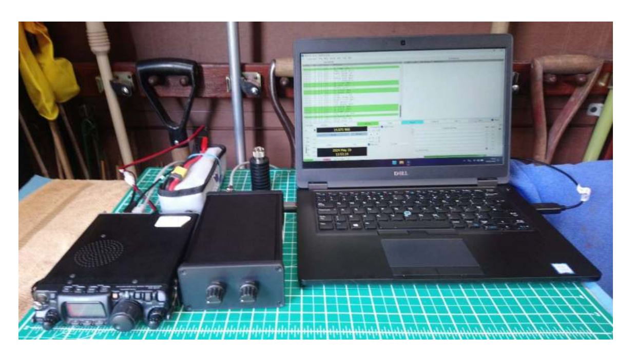
Setup complete with Yaesu FT-817, Interface and Laptop.