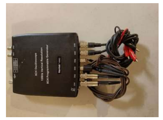
<<< Hantec 1008C</p> 8 Channel Oscilloscope