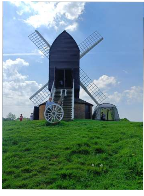
Brill Windmill in all it's glory.