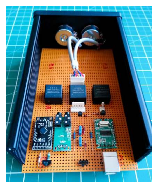
The completed PCB in it's enclosure.