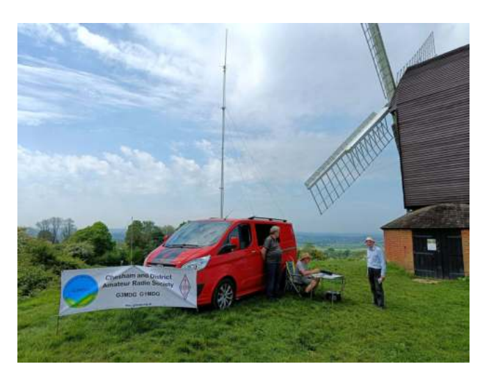
The VHF Station next to the Windmill