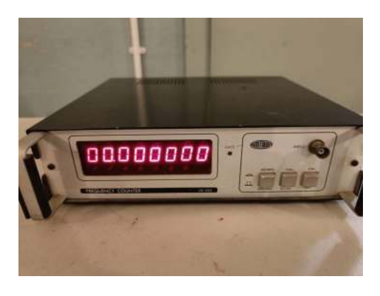
<>< Amtron UK552 >>>> Counter